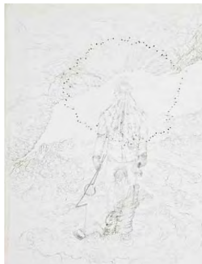
9- Matthew Barney SEKHEM : Osiris , 2009 Graphite pencil and silver leaf on paper in polyethylene frame 16 1/2 x 13 x 1 1/4 inches (41.9 x 33 x 3.2 cm) © Matthew Barney Collection of Pamela and Richard Kramlich © Courtesy Gladstone Gallery, New York and Brussels