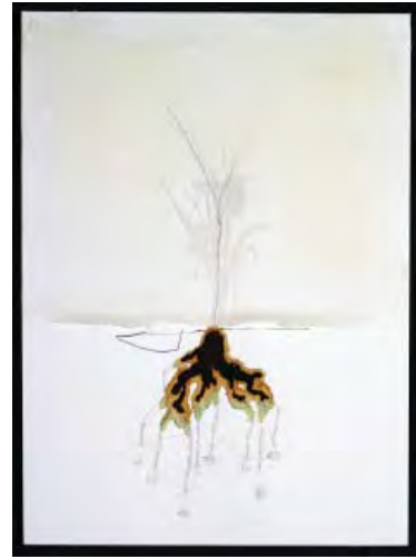
11- Matthew Barney DE LAMA LÂMINA : Orixá de Ferro , 2005 Oxidized iron powder, petroleum jelly, and graphite on embossed paper in self-lubricating plastic frame 12 1/2 x 10 x 1 1/4 inches (31.8 x 25.4 x 3.2 cm) © Matthew Barney Collection of the artist