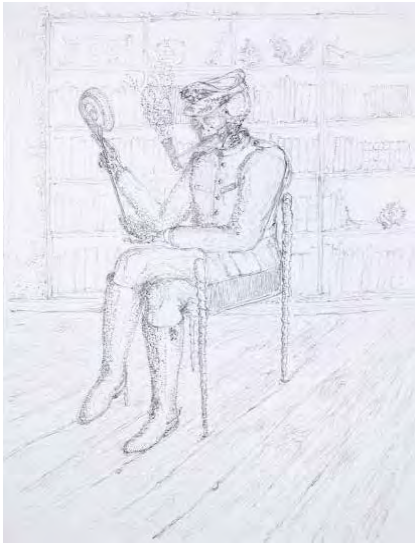
5- Matthew Barney Mirror Position , 2006 Graphite pencil on paper in self-lubricating plastic frame 13 1/2 x 11 1/2 x 1 1/4 inches (34.3 x 29.2 x 3.2 cm) © Matthew Barney Courtesy of A. Peter Strietmann © Courtesy Gladstone Gallery, New York and Brussels