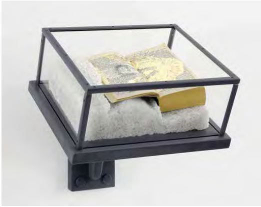
10- Matthew Barney ANCIENT EVENINGS : Ba Libretto , 2009 Pen and ink, graphite pencil, and gold leaf on paperback copy of Norman Mailer's Ancient Evenings , on carved salt base, in nylon and acrylic vitrine 15 1/2 x 13 3/4 x 14 3/4 inches (39.4 x 34.9 x 37.5 cm) © Matthew Barney Marguerite Steed Hoffman, Dallas