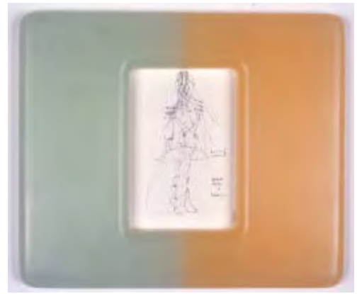
15- Matthew Barney Chrysler Suite , 2002 10 drawings : graphite and petroleum jelly on paper in acrylic frames 10 x 12 x 1 inches each (25.4 x 30.5 x 2.5 cm each) © Matthew Barney Guggenheim Museum © Courtesy Gladstone Gallery, New York and Brussels