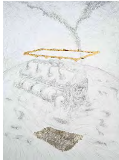
6- Matthew Barney REN : Headgasket , 2008 Graphite pencil, gold leaf, and silver leaf on paper in polyethylene frame 11 7/8 x 9 1/2 x 1 1/4 inches (30.2 x 24.1 x 3.2 cm) © Matthew Barney Don and Britt Chadwick © Courtesy Gladstone Gallery, New York and Brussels