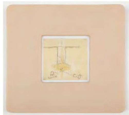
13- Matthew Barney OTTOshaft (manual) A , 1991 Graphite and petroleum jelly on paper in prosthetic plastic frame 14 x 13 1/2 inches (35.6 x 34.3 cm) © Matthew Barney Sandra & Stephen Abramson