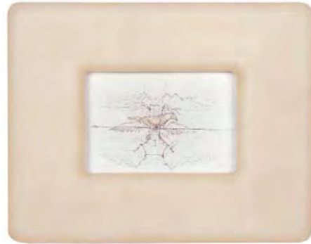
2- Matthew Barney The Ballad of Nicole Baker , 1999 Graphite pencil and petroleum jelly on paper in nylon frame 9.3/16 x 11 3/4 x 1 1/2 inches (23.3 x 29.8 x 3.8 cm) © Matthew Barney Goetz Collection, Munich