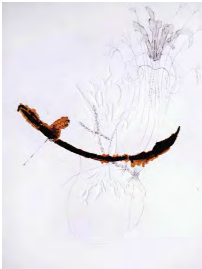
3- Matthew Barney DE LAMA LÁMINA: De Lama Lámina , 2005 Oxidized iron powder, petroleum jelly, and graphite pencil on embossed paper in self lubricating plastic frame 12 1/2 x 10 x 1 1/4 inches (31.8 x 25.4 x 3.2 cm) © Matthew Barney Collection of the artist