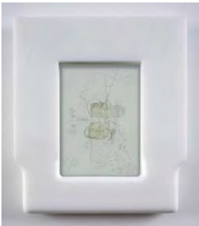
7- Matthew Barney Cetacea , 2006 Graphite and petroleum jelly on paper in self-lubricating plastic frame 13 1/2 x 11 1/2 x 1 1/4 inches (34.3 x 29.2 x 3.2 cm) © Matthew Barney Dian Woodner Collection, NY © Courtesy Gladstone Gallery, New York and Brussels