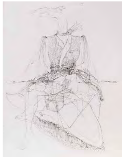
4- Matthew Barney DRAWING RESTRAINT 9: Tsusumu , 2006 (détail) Graphite pencil on paper in self-lubricating plastic frame 13 1/2 x 11 1/2 x 1 1/2 inches (34.3 x 29.2 x 3.8 cm) © Matthew Barney Emanuel Hoffman Foundation, prêt permanent à la Öffentliche Kunstsammlung, Basel