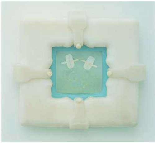
14- Matthew Barney DRAWING RESTRAINT 7 : spin track manual: KID , 1993 Graphite, acrylic paint, petroleum jelly on paper in nylon frame 14 x 14 3/8 x 2 5/8 inches (35.6 x 36.5 x 6.7 cm) © Matthew Barney Courtesy of Lehmann-Art Ltd and Rachel-Art Ltd © Courtesy Gladstone Gallery, New York and Brussels