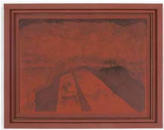
12- Matthew Barney RIVER ROUGE : Crown Victoria , 2011 Ink on paper in painted steel frame 11 3/8 x 14 3/8 x 1 1/2 inches (28.9 x 36.5 x 3.8 cm) © Matthew Barney Julie and Robert Taubman © Courtesy Gladstone Gallery, New York and Brussels