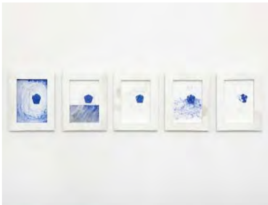
16- Matthew Barney REN : Pentastar Suite , 2008 Graphite and lapis lazuli on paper in five polyethylene frames 14 1/4 x 11 3/4 x 1 1/4 inches each (36.2 x 29.8 x 3.2 cm) © Matthew Barney Joe & Marie Donnelly