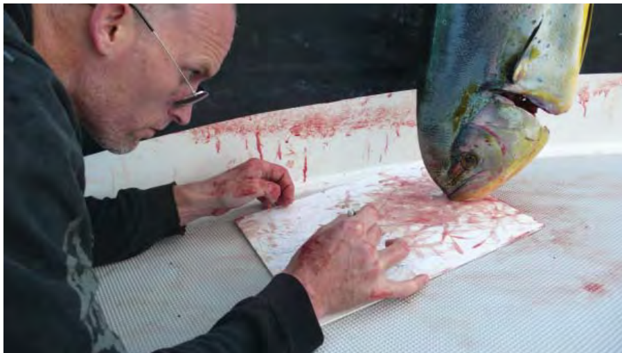
17- Matthew Barney DRAWING RESTRAINT 15, 2007 Documentary Photograph